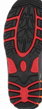
SOLE 4C (Black/Red) RUBBER GRIP HEAT RESISTANT 3

TREAD ON: Tarantula Tan Boot Tarantula Black Shoe