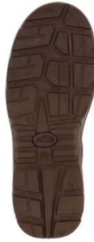
SOLE 3B (Black/Brown) OFF ROAD TERRAIN 4X4

TREAD ON: Parson Boot Lynx Shoe Assassin Chelsea Boot Assassin Chelsea NSTC Bagheera Chelsea Boot Goliath Brown Boot Goliath Black Boot Parson Boot Non Metal Goliath II Brown Boot Goliath II Black Boot