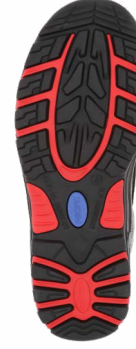
SOLE 4 (Black/Red) RUBBER GRIP HEAT RESISTANT 1

TREAD ON: Parson S1 Boot Diablo Boot Diablo Shoe