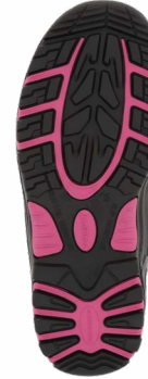
SOLE 4D (Black/Pink) RUBBER GRIP HEAT RESISTANT 4

TREAD ON: Ladies Black Widow Boot Ladies RedBack Shoe