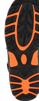
SOLE 4B (Black/Orange) RUBBER GRIP HEAT RESISTANT 2

TREAD ON: Tarantula Tan Boot Tarantula Black Shoe