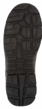
SOLE 3 (Black/Black) OFF ROAD TERRAIN 4X4

TREAD ON: Parson Boot Lynx Shoe Assassin Chelsea Boot Assassin Chelsea NSTC Bagheera Chelsea Boot Goliath Brown Boot Goliath Black Boot Parson Boot Non Metal Goliath II Brown Boot Goliath II Black Boot