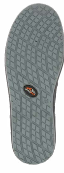
SOLE 2B (Black/Grey) WAFFLE IRON NON SLIP