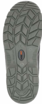
SOLE 1 (Black/Grey) EASY TREAD