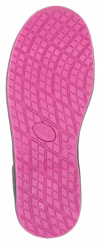
SOLE 2 (Black/Pink) WAFFLE IRON NON SLIP