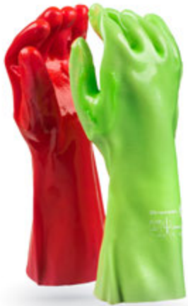
CRONUS/RGE & RGW