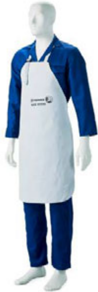
ACE ONE 60X90