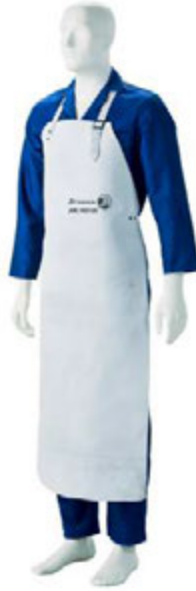
ACE ONE 60X120