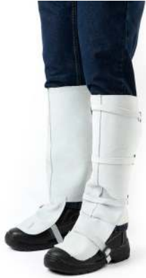
DH SPAT KNEE